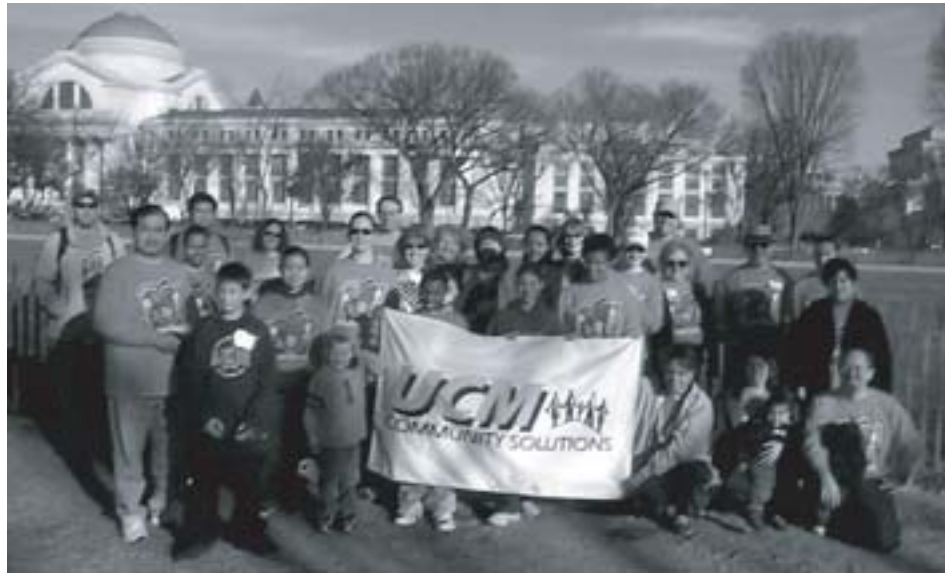
UCM staff joined with Christian Relief Services staff to support UCM in the Help the Homeless Walkathon.

We see homeless people every day—sleeping in the parks and on the streets. However, we don't see most homeless individuals because they stay in emergency shelters, hide in abandoned buildings, or live in their cars. Nearly half of the areas homeless individuals are women and children and roughly half of those children are under the age of five.