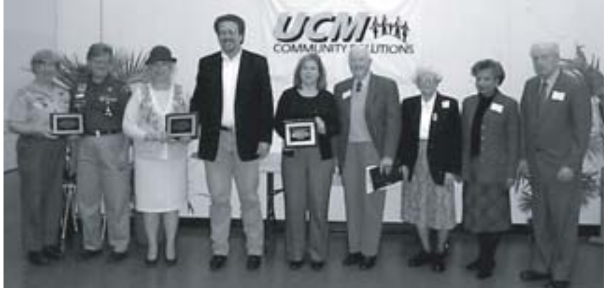
UCM presents awards of appreciation to the representatives for the Colonial District Boy Scouts of America, Rising Hope United Methodist Church, Plymouth Haven Baptist Church and Belvoir Woods Protestant Mission Society.