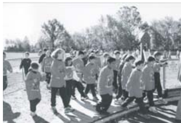
St. Louis Catholic School youth walk to support UCM at the Help the Homeless Walkathon.

UCM is truly grateful to its donors who sent in money to help us qualify for matching funds, our corporate partners (UCM Friends of the Homeless, UCM's Coalition for the Homeless, Old