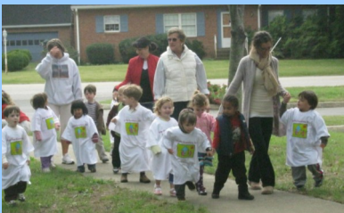
Youngsters from St. Luke's Day School walked to fight homelessness on October 6th and 7th.