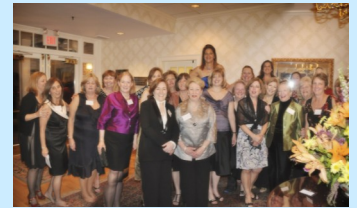
The Friends of UCM at the 2010 Spring Gala.